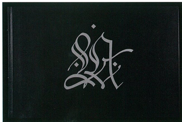
Getty Black Book cover