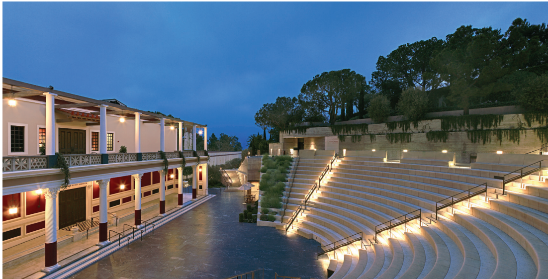
View of the Barbara and Lawrence Fleischman Theater and the entrance of the J. Paul Getty Museum at the Getty Villa.

The performance is approximately ninety minutes long. There is no intermission.