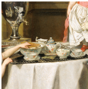
German artist Johann Zoffany painted John, Fourteenth Lord Willoughby de Broke, and his Family in about 1766.

In this painting, a family of 5 is having teatime together. DESCRIBE the toy that one of the children is playing with.