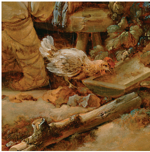
French artist Jean-Baptiste Le Prince painted The Russian Cradle in about 1764–1765.

In the center of this painting, a baby lies in a cradle hanging from a tree and is surrounded by farm animals. NAME two farm animals you see in this painting.