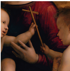
Italian artist Fra Bartolommeo painted Rest on the Flight into Egypt with St. John the Baptist in about 1509.

A man, woman, and two children rest under the shade of a palm tree.