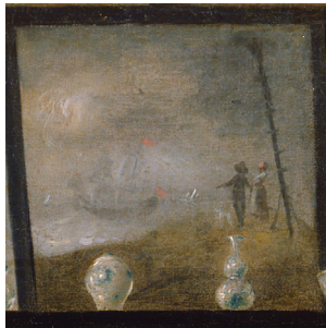
Dutch artist Quiringh Gerritsz van Brekelenkam painted Family Group at Dinner Table in about 1658–1660.

In this painting, a family of 5 finishes their meal. DESCRIBE the painting within the painting, on top of the cabinet: