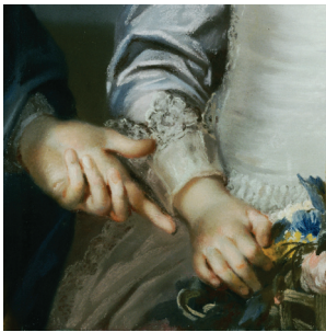
English artist Francis Cotes painted Portrait of Joseph Gulston and his Brother John Gulston in 1754.

Two brothers pose together in this painting. One looks at you while the other looks at his older brother. WHAT is the older brother pointing at?