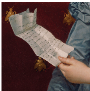
French artist Jacques-Louis David painted The Sisters Zénaïde and Charlotte Bonaparte in 1821.

In this painting, two sisters read a letter from their father. Their uncle was Napoleon, a leader of France in the 1800s. Their family's emblem is shown on the couch they are sitting on. What is it?