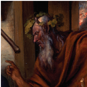
Dutch artist Jan Steen painted Peasant Family in about 1660–1662.

A family of 6 dines with a most unexpected houseguest in this painting.