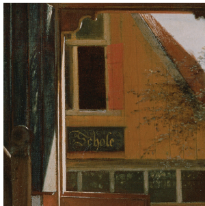
Pieter de Hooch painted A Woman Preparing Bread and Butter for a Boy in about 1660–1663

A mother butters bread for her son in this painting. WHAT does the sign on the building you see through the open door say?