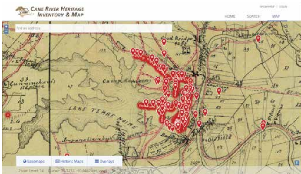
Screenshot of the Cane River Heritage Inventory and Map.