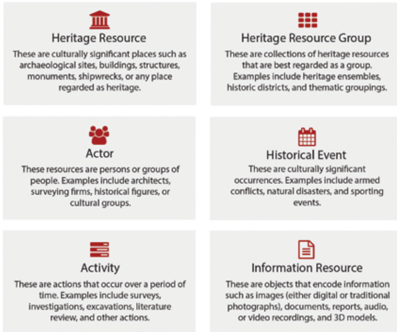
Arches default resource types.

The default version of Arches includes six different types of resources (shown below) that can be recorded and related to each other. These six resources can be modified or added to.