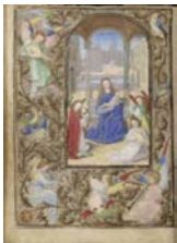
13. Lieven van Lathem Flemish, about 1430 - 1493, active 1454 - 1493 The Virgin and Child with Angels , about 1471 from Prayer Book of Charles the Bold Tempera colors, gold leaf, gold paint, silver paint, and ink on parchment Leaf: 12.4 x 9.2 cm (4 7/8 x 3 5/8 in.) The J. Paul Getty Museum, Los Angeles Ms. 37, fol. 5v (89.ML.35.5v)