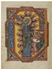
21. Unknown The Evangelist John, 1615 from Gospel Book Tempera colors, gold paint, and gold leaf on glazed paper Leaf: 23 x 17.1 cm (9 1/16 x 6 3/4 in.) The J. Paul Getty Museum, Los Angeles Ms. Ludwig II 7, fol. 193v (83.MB.71.193v)