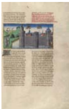
15. Unknown A Vision of Gilded Horsemen over Jerusalem , about 1475 from Mirror of History Tempera colors, gold leaf, and gold paint on parchment Leaf: 43.8 x 30.5 cm (17 1/4 x 12 in.) The J. Paul Getty Museum, Los Angeles Ms. Ludwig XIII 5, v2, fol. 60 (83.MP.148.2.60)