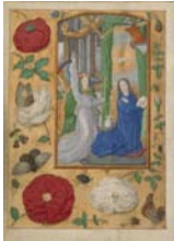
17. Workshop of Gerard Horenbout Flemish, 1465 - 1541, active 1487 - about 1520 The Annunciation, about 1500 from Book of Hours Tempera colors and gold paint on parchment Leaf: 15.2 x 11.1 cm (6 x 4 3/8 in.) The J. Paul Getty Museum, Los Angeles Ms. Ludwig IX 17, fol. 15v (83.ML.113.15v)