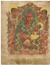
19. Unknown The Virgin and Child with the Angels Gabriel and Michael , about 1504 - 1505 from Gospel Book Tempera on parchment Leaf: 34.5 x 26.5 cm (13 9/16 x 10 7/16 in.) The J. Paul Getty Museum, Los Angeles Ms. 102, fol. 19v (2008.15.19v)