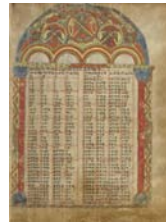
20. Unknown Canon Table Page , about 1504 - 1505 from Gospel Book Tempera on parchment Leaf: 34.5 x 26.5 cm (13 9/16 x 10 7/16 in.) The J. Paul Getty Museum, Los Angeles Ms. 102, fol. 20 (2008.15.20)