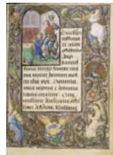
14. Lieven van Lathem Flemish, about 1430 - 1493, active 1454 - 1493 Charles the Bold Presented by Saint George , about 1471 from Prayer Book of Charles the Bold Tempera colors, gold leaf, gold paint, silver paint, and ink on parchment Leaf: 12.4 x 9.2 cm (4 7/8 x 3 5/8 in.) The J. Paul Getty Museum, Los Angeles Ms. 37, fol. 6 (89.ML.35.6)