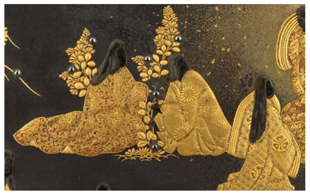
Here young women gather in the empress's garden, an illustration from chapter twenty-eight, Nowaki ( The Typhoon ): "Her Majesty was having her page girls go down into the garden to feed dew to the crickets in their cages."