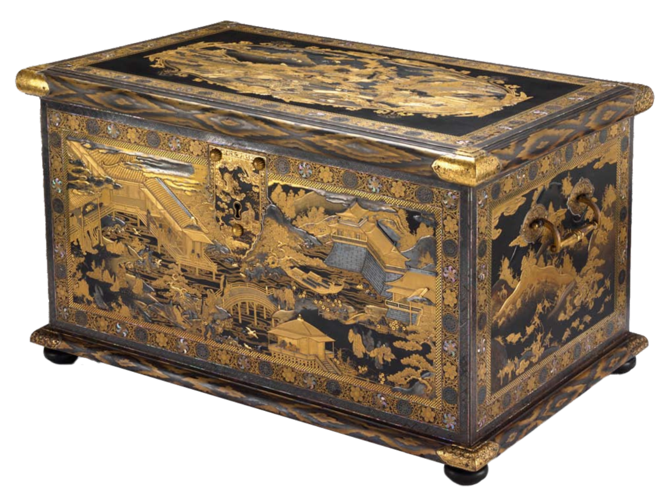
Above and cover detail: The Mazarin Chest, Japanese (Kyoto), Edo period, about 1640. Wood covered in black lacquer with gold and silver hiramakie and takamakie lacquer; inlaid with gold, silver, and shibuichi alloy; mother-of-pearl; and gilded copper fittings; 59 x 101.5 x 63.9 cm

Made in Kyoto, the Mazarin Chest was shipped to Europe and was owned by a series of prominent collectors before it was acquired by the Victoria and Albert Museum in 1882. Its name is derived from the Mazarin–La Meilleraye coat of arms on the key, indicating that it was once owned by a member of that French family. The chest is extraordinary for its