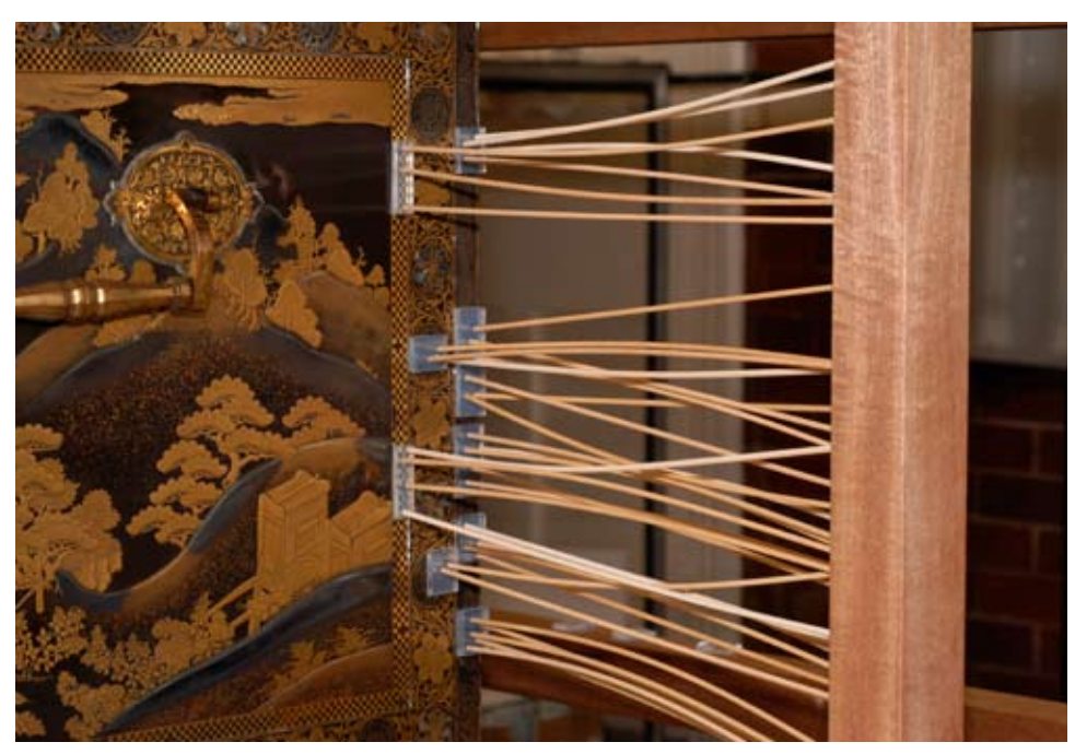
The borders of the chest are decorated with a technique incorporating elements of shell and metal foil. In this process, the shell and metals (silver and gold or tin) were cut to shape and affixed to the surface of the lacquer. Over time, many of these decorative pieces became loose. Here a section of the chest is shown during conservation treatment, when spring clamps were used to reset the loose elements.

This exhibition marks the completion of an unprecedented international conservation and research project on the Mazarin Chest that was supported by a major grant by the Getty Foundation and contributions from the Toshiba International Foundation and the Victoria and Albert Museum. Before conservation treatment began in 2005, the chest was in poor condition due to centuries of exposure to light and cyclical changes in temperature and relative humidity. Backed by thorough scientific and art historical research, the treatment had two aims. The first was to stabilize the chest and its decorations. The second was to develop an integrated approach to the conservation of lacquer