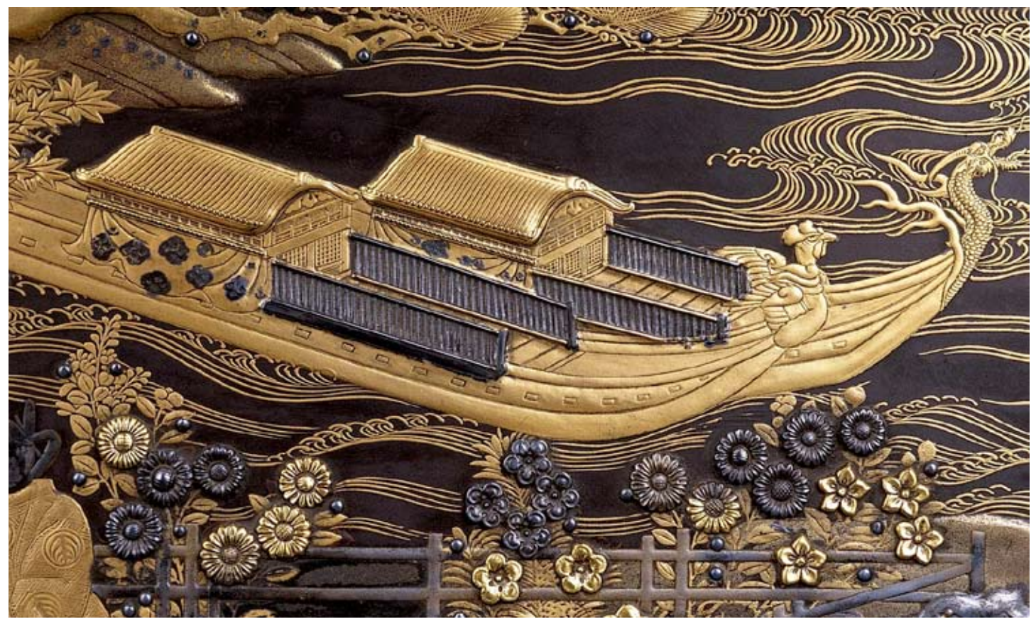
Two boats, one with a bow shaped like a dragon's head and the other shaped like a phoenix's head, are a reference to chapter twenty-four, Kochō ( But-terflies ): "Genji had Chinese-style barges made and outfitted, and on the very day they were launched, he summoned people from the Office of Music to perform on them."

The front panel of the Mazarin Chest is decorated with various scenes referring to different chapters in The Tale of Genji , a masterpiece of Japanese literature written in the early eleventh century by Murasaki Shikibu, an aristocratic woman. The tale is an extended novel recounting the life, love affairs, and political fortunes of Prince Genji and his immediate successors. Considered to be the world's first novel, the book is richly evocative of court life in medieval Japan.