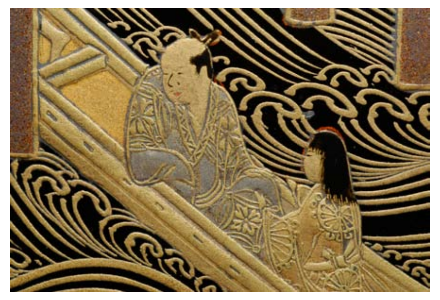
The extraordinary level of craftsmanship achieved by the lacquer masters is evident in this detail of two figures seen in the larger detail of a boat passing under a bridge (above). The patterns on the clothing were carefully rendered, and the facial features were highlighted with touches of black and red lacquer.