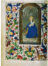
23. Unknown The Virgin and Child Enthroned within a Church , about 1450 - 1455 from Book of Hours Tempera colors, gold leaf, and ink on parchment Leaf: 19.4 x 14 cm (7 5/8 x 5 1/2 in.) The J. Paul Getty Museum, Los Angeles Ms. 2, fol. 243v (84.ML.67.243v)