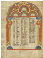
25. Unknown Canon Table Page , about 1504 - 1505 from Gospel Book Tempera on parchment Leaf: 34.5 x 26.5 cm (13 9/16 x 10 7/16 in.) The J. Paul Getty Museum, Los Angeles Ms. 102, fol. 21v (2008.15.21v)