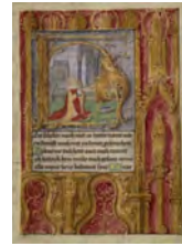
8. Workshop of Gerard Horenbout Flemish, 1465 - 1541, active 1487 - about 1520 Initial H: David in Prayer, about 1500 from Book of Hours Tempera colors and gold paint on parchment Leaf: 15.2 x 11.1 cm (6 x 4 3/8 in.) The J. Paul Getty Museum, Los Angeles Ms. Ludwig IX 17, fol. 71 (83.ML.113.71)