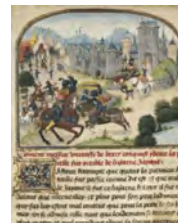
10. Loyset Liédet Flemish, active about 1448 - 1478 and Pol Fruit Flemish, active about 1468 The Abduction of Ydoire , written 1463 - 1465; illuminated 1467 Cutting from History of Charles Martel Tempera colors, gold leaf, and gold paint on parchment Leaf: 23.2 x 18.8 cm (9 1/8 x 7 3/8 in.) The J. Paul Getty Museum, Los Angeles Ms. Ludwig XIII 6, leaf 1 (83.MP.149.1.recto)