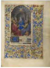
5. Jean Bourdichon French, 1457 - 1521, active Tours, France, Early 1480s - 1521 Pentecost, about 1480 - 1485 from Katherine Hours Tempera colors, gold, and ink on parchment Leaf: 16.4 x 11.6 cm (6 7/16 x 4 9/16 in.) The J. Paul Getty Museum, Los Angeles Ms. 6, fol. 80 (84.ML.746.80)