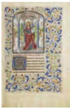
27. Willem Vrelant or workshop Flemish, died 1481, active 1454 - 1481 Christ Blessing , early 1460s from Arenberg Hours Tempera colors, gold leaf, and ink on parchment Leaf: 25.6 x 17.3 cm (10 1/16 x 6 13/16 in.) The J. Paul Getty Museum, Los Angeles Ms. Ludwig IX 8, fol. 34 (83.ML.104.34)