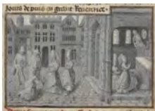
9. Lieven van Lathem Flemish, about 1430 - 1493, active 1454 - 1493 Miracle of the Adulterous Woman's Repentance, about 1460 Miniature from Miracles of Our Lady Tempera colors and gold paint on parchment Leaf: 13.2 x 17.8 cm (5 3/16 x 7 in.) The J. Paul Getty Museum, Los Angeles Ms. 103, recto (2009.41.recto)