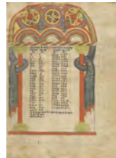
26. Unknown Canon Table Page , about 1504 - 1505 from Gospel Book Tempera on parchment Leaf: 34.5 x 26.5 cm (13 9/16 x 10 7/16 in.) The J. Paul Getty Museum, Los Angeles Ms. 102, fol. 22 (2008.15.22)